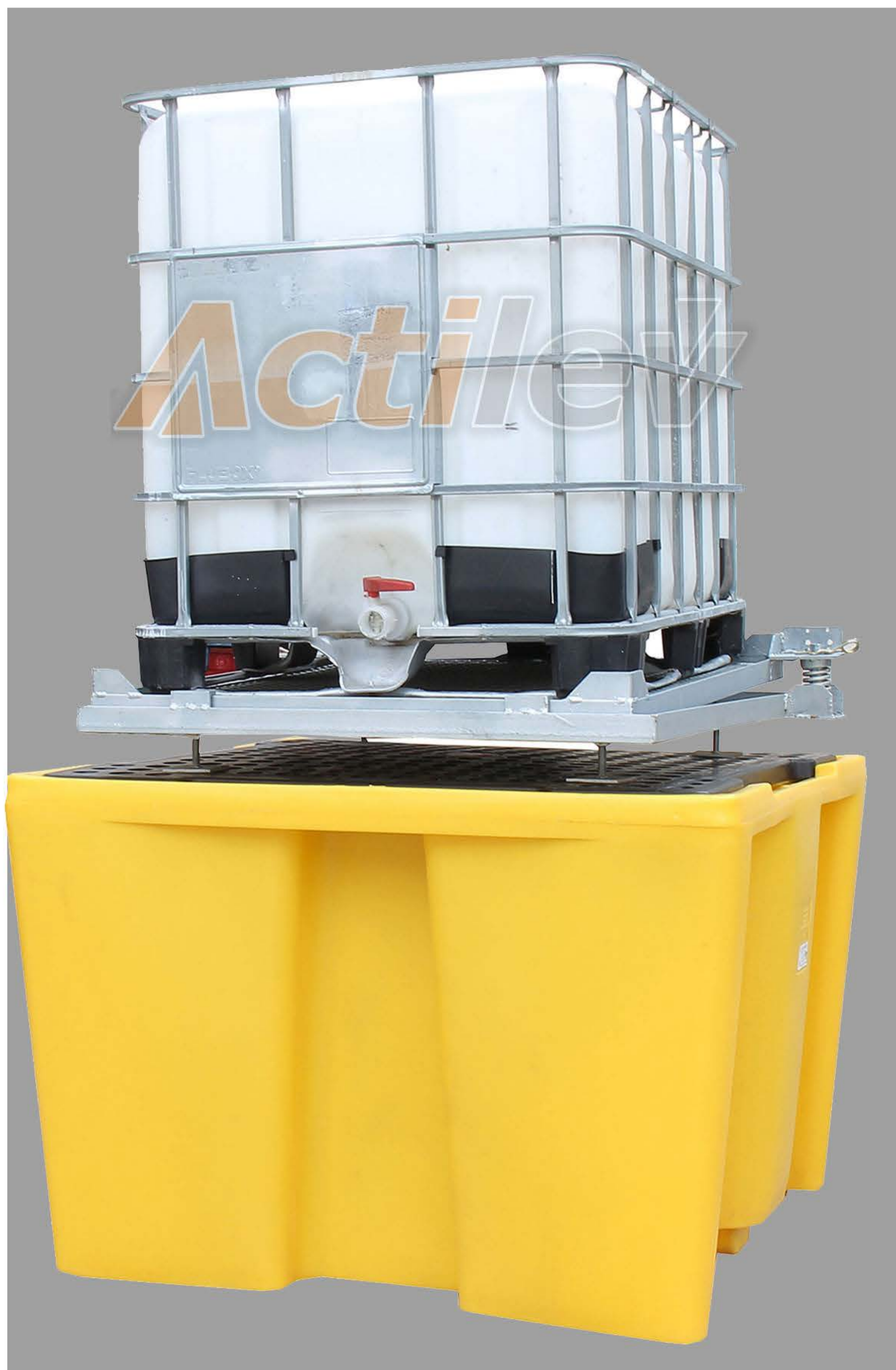
Solution with available retention tank – Contact us

When your IBC contains less than 100 litres, the springs gradually decompress causing a slope of 5% that optimises the drain of your tank. Specially designed for viscous and expensive liquids.